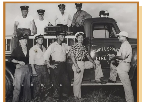
Firefighters posing with the District's first fire engine, circa the 1950's

Thank you, citizens of Bonita Springs, for allowing the Bonita Springs Fire Control & Rescue District to serve you each and every day. Since 1965, the District has enjoyed its relationship with and involvement within the community. The Fire District and all its person- nel truly take great pride and pleasure in protecting the beautiful city of Bonita Springs!